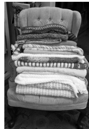
Just a small sampling of lovely knit and crocheted baby blankets delivered to local area charities last month.

Knitting Bee's Charity Stitching Circle continues to amaze! In mid-December we delivered nearly a dozen afghans to the Baby Love Blanket Drive benefiting Outside/In and Yolanda House, an additional 15 blankies (many with matching sweaters and caps) to Emanuel Hospital's neonatal unit, at least a dozen kid's caps to Hillsboro Headstart and more than 50 warm hats and scarves to the homeless at Transition Projects in Old Town. Charity Stitching Circle meets the first Wednesday of every month from 10:30am to noon. Everyone is welcome to contribute handknit or crocheted items, even if you can't make the meeting. Help us make a difference in our community!