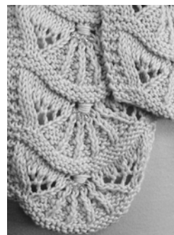
Seaside Scallops Beaded Scarf

CHECK OUT MORE PROJECT PHOTOS AT THEKNITTINGBEE.COM !